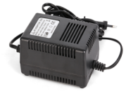
AC24V/3A Power Supply